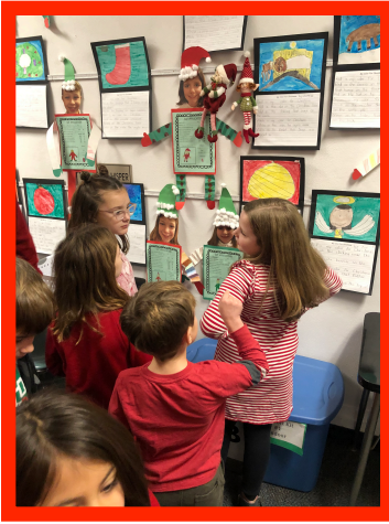
Second Graders found their